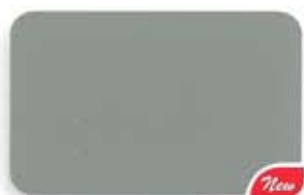
Whetstone WM 20987