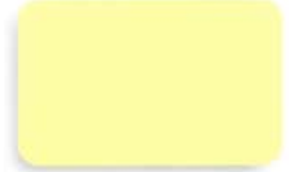
French Linen WM 26535