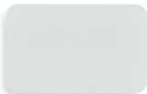
Tungsten WM 20412