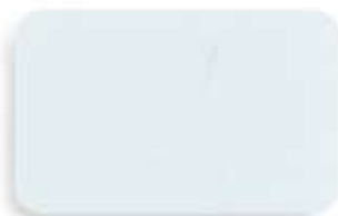
Maldivian Cloud WM 21684