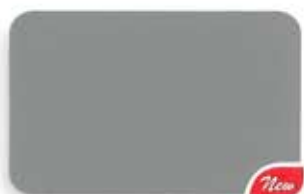
Ominous WM 20989