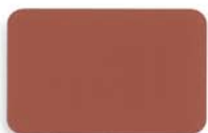
Terra Cotta WM 22199