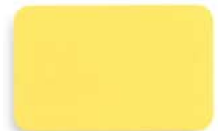
Orange Farm WM 26604