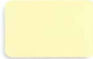
Creme Brulee WM 27141