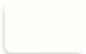
Orion WM 26273