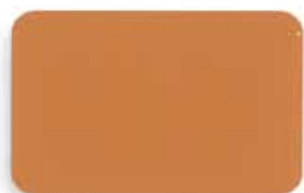
Mocha Woods WM 22658