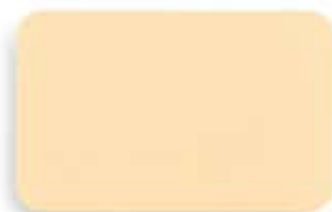
Apricot WM 22135