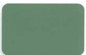
Kenyan Leaves WM 23599