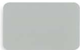
Mercury WM 20235