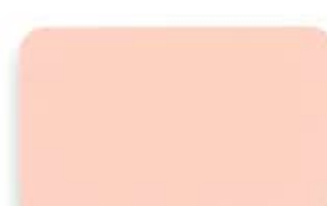
Cherry Blossom WM 24258