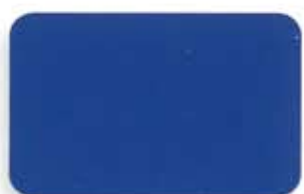
Wira Blue WM 21221