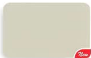
Burmese Beige WM 26729