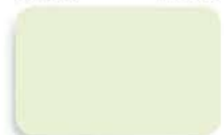
Cool Comfort WG 9281