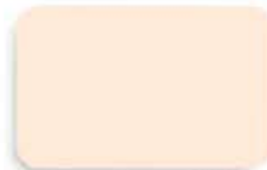
Persimmon White WG 9452