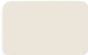
Pebblewalk WG 9548