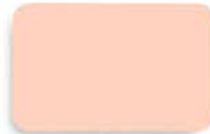
▲ Sunset WG 9254