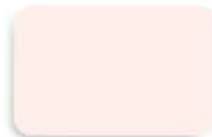
Rose Fever WG 9117