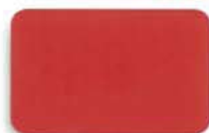
● e.red **WG 9002