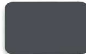
Dawn Grey WG 9747