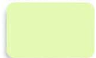
Lettuce WG 9149