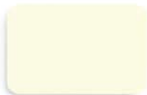
Sunflower White WG 9451