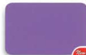
Prophetic Purple **WG 9183