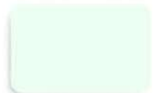
Ocean White WG 9610