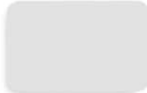
Tungsten WG 9412