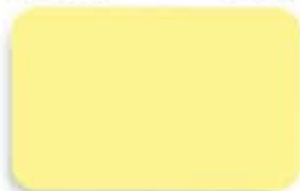
French Linen WG 9535