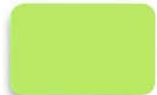
Apple Pie **WG 9977