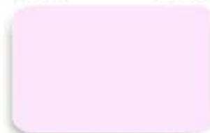
Trendy WG 9272