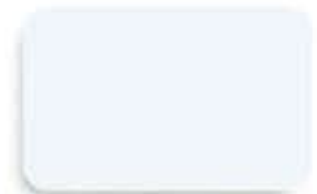
Glacier Blue WG 9190