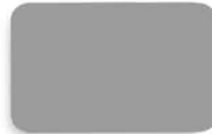
Gunsmoke Grey WG 9307