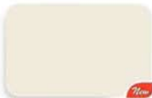
Morning Dew WG 9202