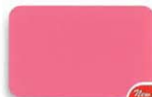
Exotic Bloom **WG 9036