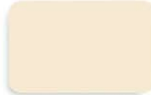
Orion WG 9273