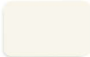
Purple Lint WG 9083