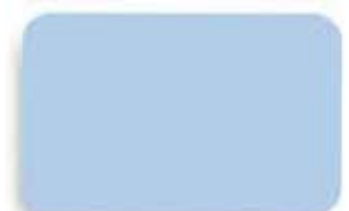
▲ Blue Eye's WG 9993