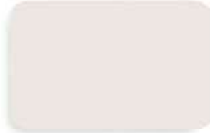
Purple Grey WG 9160