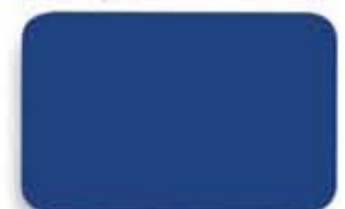
Wira Blue **WG 9221