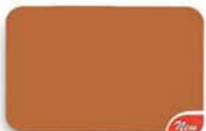
Native Soil **WG 9124