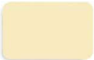
Vanilla WG 9704