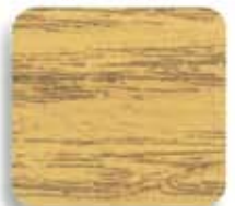
TG 111 SATIN

Final color tone will depend on the type of wood applied on.