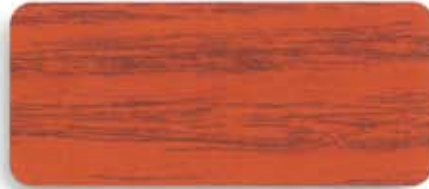
TG 107 REDWOOD