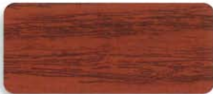
TG 106 BEECH