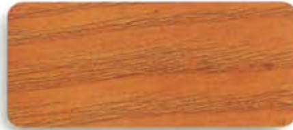
TG 105 RUST