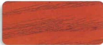
TG 108 ROSEWOOD