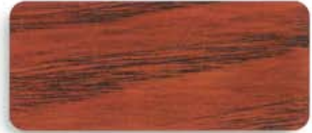
TG 104 TEAK