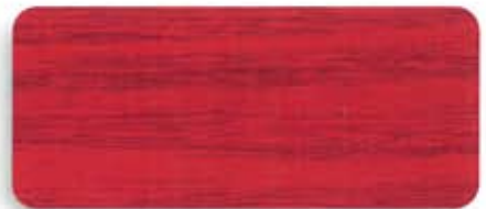
TG 120 MAROON