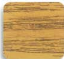
TG 100 CLEAR