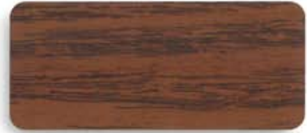
TG 101 MERANTI