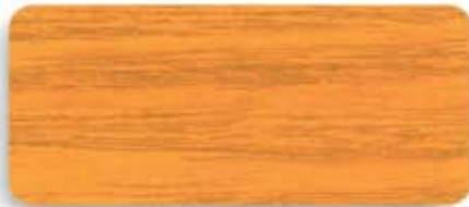
TG 103 GOLDEN PINE