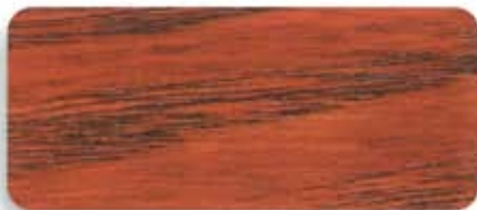
TG 102 MAHOGANY