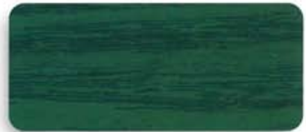
TG 109 JUNIPER