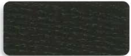
TG 110 CHARCOAL