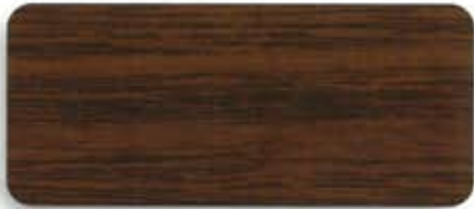
SS 12702 Maple Brownie