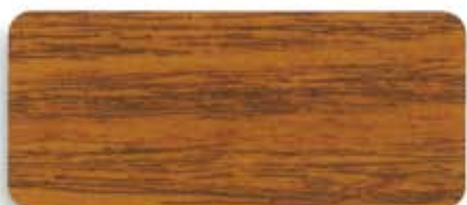
SS 16601 Gold Bar