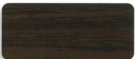
SS 10484 Ebony