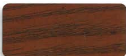
SS 14331 Walnut