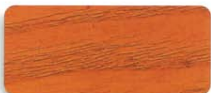
SS 16325 Honeypine