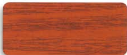
SS 14337 Rosewood

Exterior UV Protection wood varnish (Solvent Base)