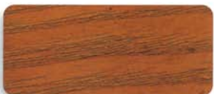
SS 12493 Mahogany