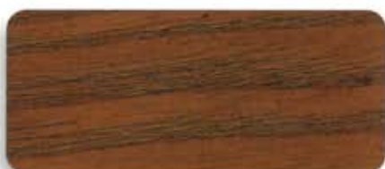
SS 12701 Arabian Dust