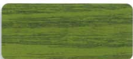
SS 11698 Antique Jade