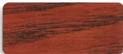
SS 14338 Antique